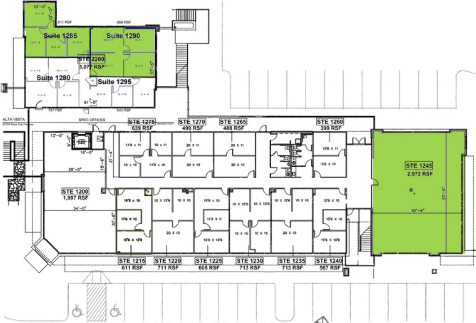
BUILDING 1 – SECOND FLOOR DIMENSIONS SHOWN ARE APPROXIMATE ONLY