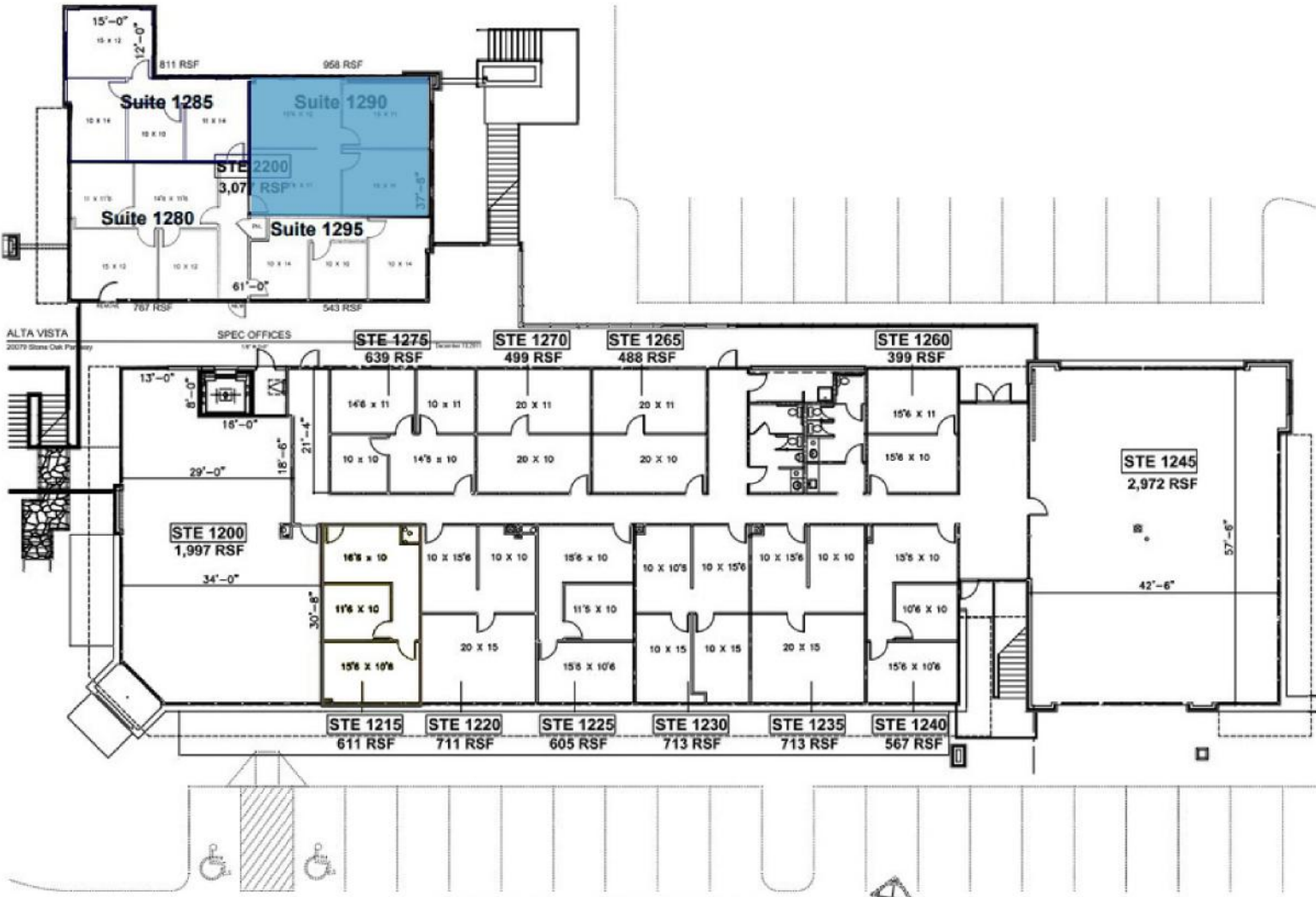
BUILDING 1 – SECOND FLOOR DIMENSIONS SHOWN ARE APPROXIMATE ONLY

SECOND FLOOR OFFICE SPACE SUITE 1290 | 958 RSF